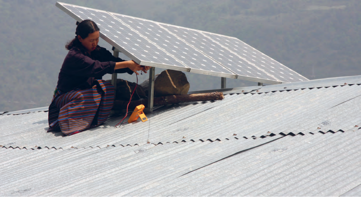
A woman installing solar panels on the roof in Bhutan.

austerity and withdrawal of public services. Procurement decisions may also trigger significant human rights and environmental concerns in the supply chain.