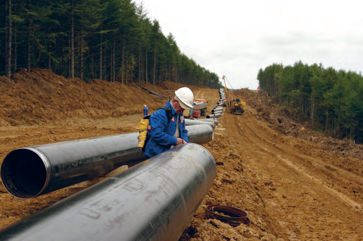
Pipeline construction and foundation work is undertaken for a gas plant and oil terminal in Russia.

jurisprudence within such a chaotic system. Clearly, fundamental reforms are needed, yet most IIA reform proposals advanced so far leave structural shortcomings and underlying asymmetries of power untouched.