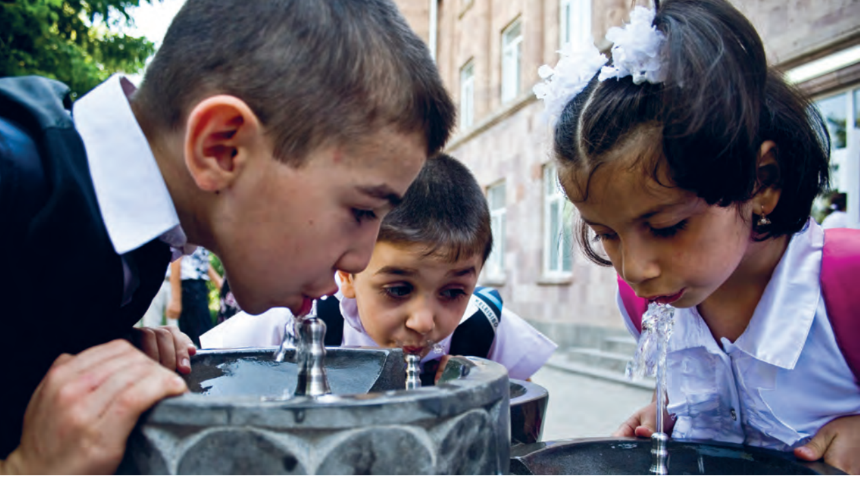
Students drink fresh and clean water at a drinking fountain in School #2 in Artashat, Armenia.

vulnerable segments of the society underserved or unserved, perpetuating exclusion, and exacerbating inequalities between population groups. The human rights framework helps us to understand inequality as a function of conflicting power relations, with a focus on disparities caused by discrimination. Human rights law directs our attention to the root causes of exclusion and requires legislative, budgetary, administrative and other measures to remove access barriers, with the ultimate aim of achieving substantive (de facto) equality.