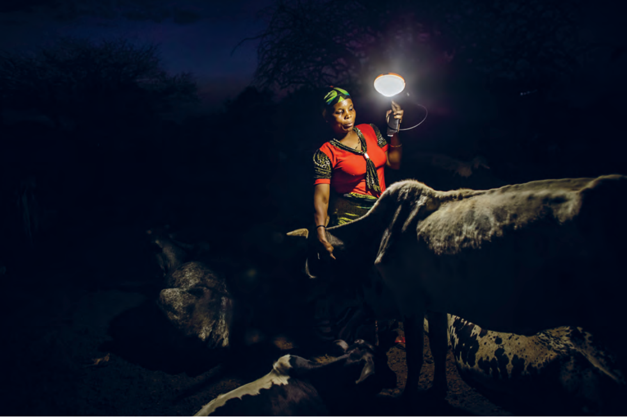
In Mforo village, Tanzania, a Solar Sister entrepreneur checks on her cows during the evening.

may be direct impacts on affected communities and individuals arising from inadequate transparency and weak social and environmental safeguards.