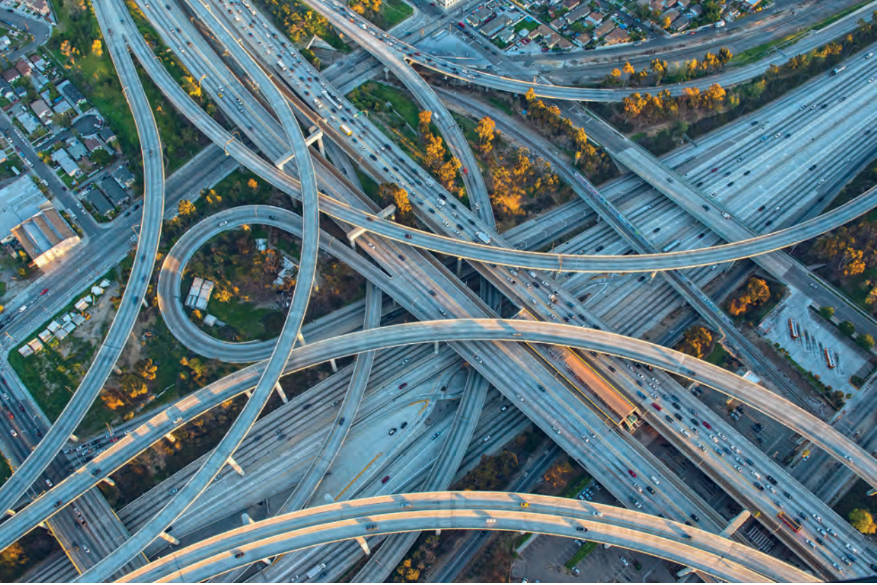
Aerial view of highway interchange in cityscape

while avoiding gridlocks and delays, and make more sustainable progress toward the SDGs.